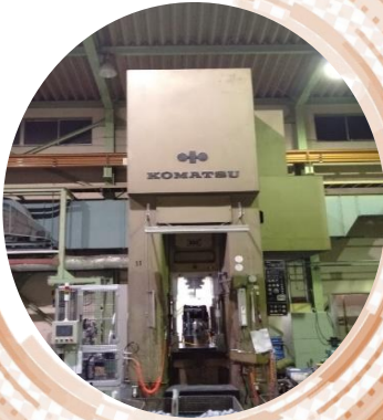
KOMATSU 400t (L1C400L)

Forging of Long shafts with Splines on either sides.